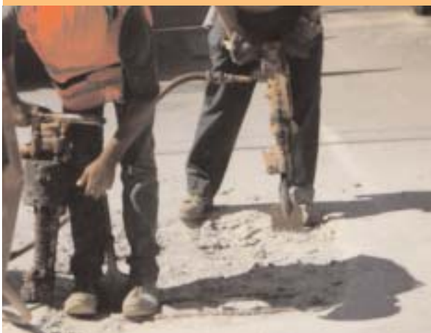
Break out damaged surface